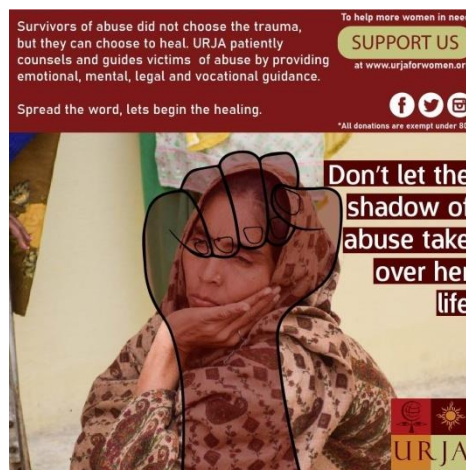
URJA posters on domestic violence