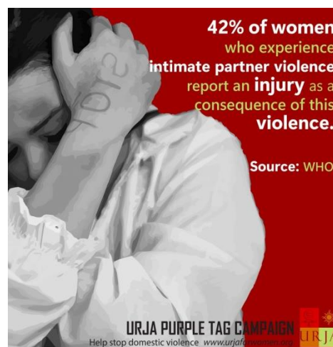
URJA posters on domestic violence