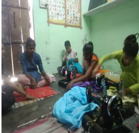
Sewing and stitching class

Vocational Training- To make women and girls independent, vocational training on tailoring and stitching is given by URJA to women and adolescent girls. Around 10 women and girls benefitted from URJA's stitching course in 2020-21. The vocational class was affected due to the pandemic girls due to the lockdown phases.