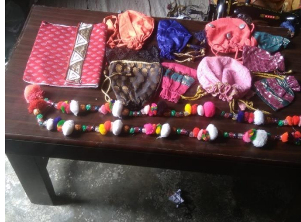
Products made during sewing and stitching class