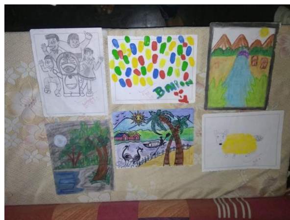
Drawings by kids