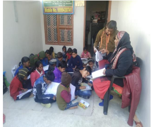
Supplementary class Pandvala