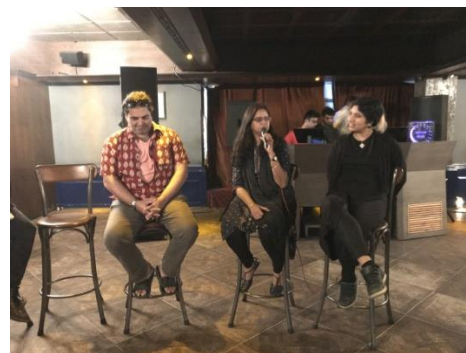
Legal awareness cum fundraiser event by URJA and Coven Code