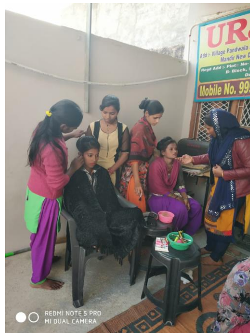
Beauty parlour class in progress