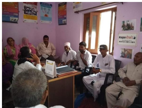
Mahila Panchayat Meetings at Jaffarpur Kalan