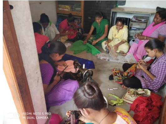
Sewing and stitching class

Beauty Parlour Class- URJA's beauty parlour class in Pandvala Kalan village teaches young girls employability skills so that they can learn skills through which they can earn some income and support their families. In 2019-20, there were almost 6 girls who benefitted from the course. The girls are taught basic make up, cleaning, waxing, pedicure, manicure and bridal make up.