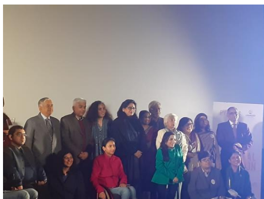
URJA attended a function by PVR Nest on disability rights.

URJA attended a PVR Nest function on “A Day on Social Inclusion” with PVR NEST and Ummeed-Ray of hope Society’ on 29th January, 2020 at PVR PLAZA at 10:00AM – 12:30PM . The event focused on disability rights and stressed on the need to focus on accessibility and inclusivity of disabled people.